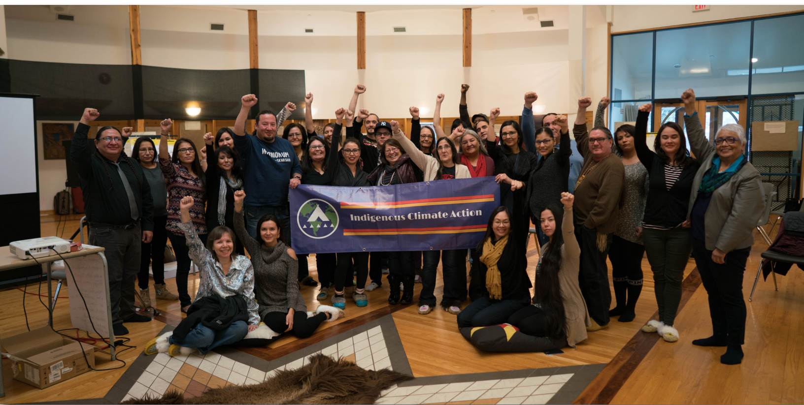
Image: ICA's first Steering Committee meeting in 2017

Non-Indigenous people and organizations who would like to actively support the second phase of Decolonizing Climate Policy in Canada can donate to ICA on our website ( IndigenousClimateAction.com/donate ).