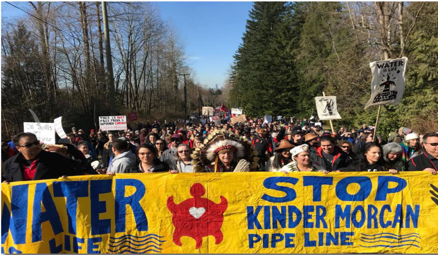
Image: protest against the Kinder Morgan Pipeline in 2018