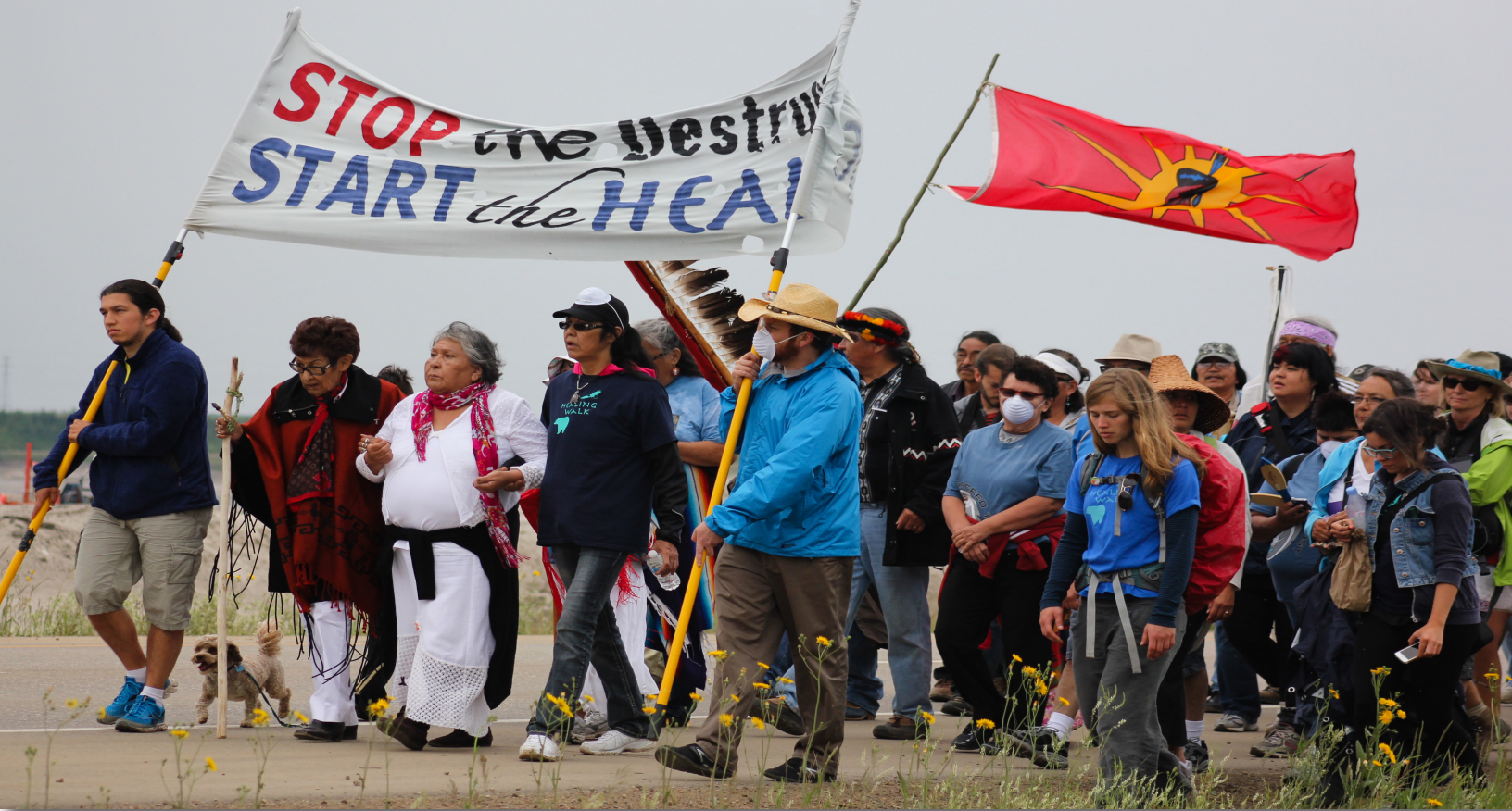
Image from the 2013 Tar Sands Healing Walk