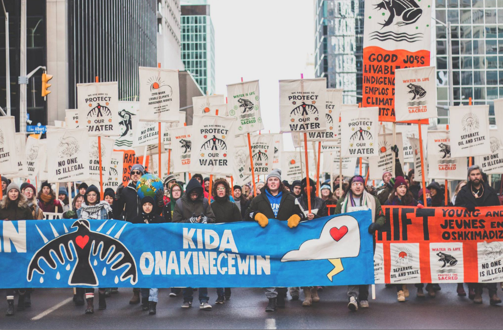
March in Ottawa during the 2019 Powershift conference. The banner on the left was designed by Christi Belcourt and Isaac Murdoch. It says "Obinin Kida Onakinegewin," an Anishinaabeg phrase that translates to "lift our laws"

Additionally, as with other PCF Pillars, Indigenous Peoples are referred to in this section as one of many stakeholders, and not as self-governments. For example, on page 38, it is stated that “[e]fforts to coordinate and focus investment must go beyond governments and involve the collaboration of industry, stakeholders, academia, and Indigenous Peoples in the innovation process.”