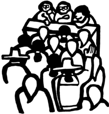
Illustration: Rini Templeton