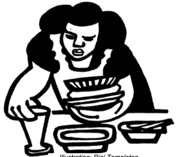
Illustration: Rini Templeton

Around the world, women tend to be poorer than men. Globalization has widened and deepened the poverty of women. With its emphasis on privatization and social cutbacks, it has reinforced the age-old reliance of the global economy on the unpaid and underpaid caring work of women. In the global South, many women find themselves obliged to migrate and take jobs as domestic workers in order to support their families.