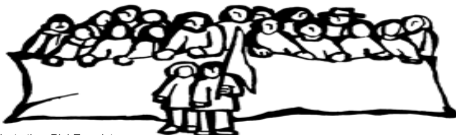
Illustration: Rini Templeton

no privacy. When status is linked to employment, the fear of deportation makes it extremely difficult for workers to demand their rights.