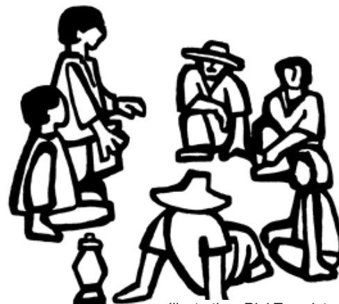
Illustration: Rini Templeton

Much faith based reflection on the theme of refugees and migration focuses on the Biblical call to “welcome the stranger.” The stranger, by definition, is outside our community, set apart by different beliefs, customs, and ways of speaking. Often the stranger inspires fear. The Biblical call to welcome the stranger invites us to go beyond our mistrust and suspicion in order to welcome newcomers into our community.