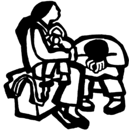
Illustration: Rini Templeton

Refugees deserve our compassion. Refugees have no choice but to leave their country in order to escape persecution, torture, even death. This we know. Many of our own churches have sponsored refugees to come from overseas. We have heard their stories of suffering and flight. But what about migrants?