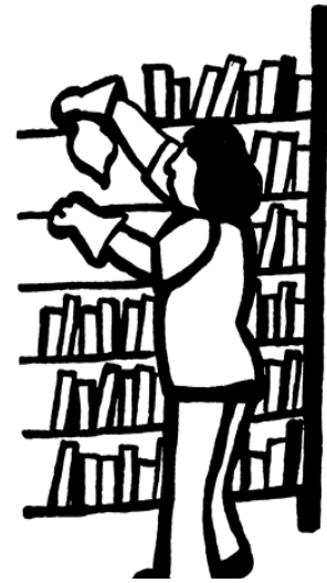
Illustration: Rini Templeton

Growing global inequality is forcing more and more people to migrate for survival. At the same time, the immigration policies of many industrialized countries are becoming increasingly restrictive. Many of those forced to move have no legal options. The result is a growing number of clandestine migrants – estimated at 30 to 40 million worldwide. Though precise numbers are difficult to determine, researchers estimate that there are between 20 000 and 200 000 people living without full legal status in Canada.