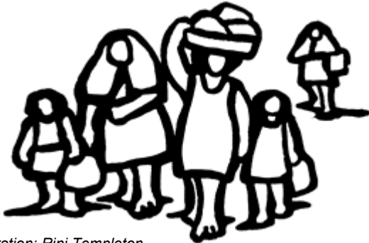
Illustration: Rini Templeton

We live in a time of contradictions. Globalization means growing mobility for capital and goods, but increasing restrictions on the movement of people. As free trade and privatization widen the economic divide between North and South, a