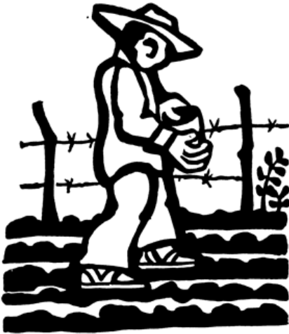
Illustration: Rini Templeton